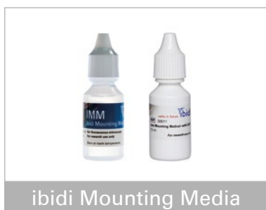
ibidi Mounting Media